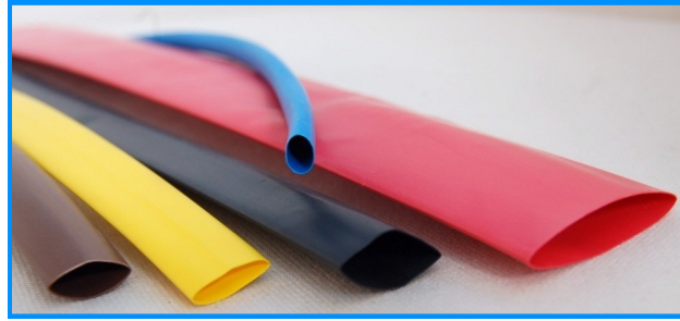
Standard Colours & Colour Codes