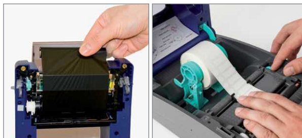
Step 1: Insert media