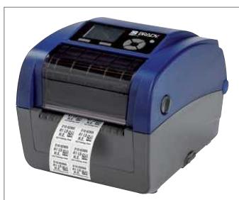
Step 3: Print