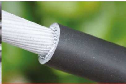
CLEAN BREAK OFF