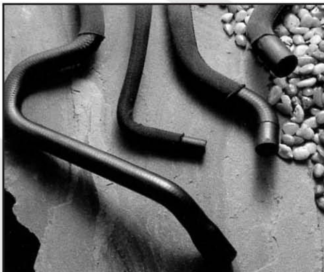
The highly flexible woven construction allows easy installation onto awkward substrates