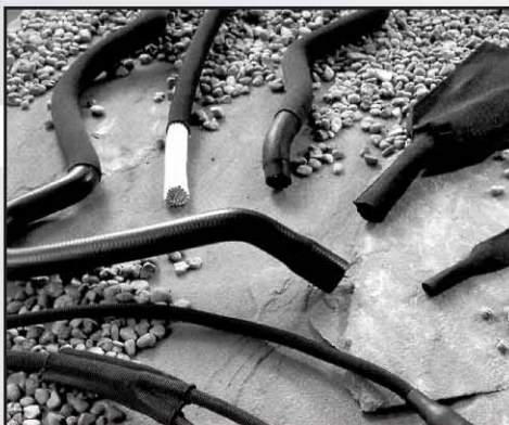
Woven fabric tubing with 2:1 shrink ratio

Warp material: Polyester Weft material: Irradiated, modified polyolefin Coating: Modified polyolefin