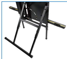
Stable Rear Support