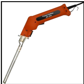
KD-5HG Hot Knife Cutter with 200mm Blade in 230/110V