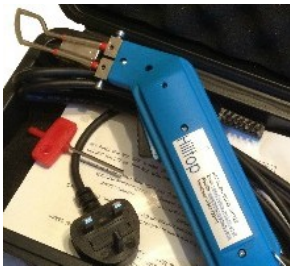
HC300 Hand Held Hot Knife Cutter with Case

To install the sleeving over your application, just push the flared end over the ends of the wires and “walk” the sleeve down the length of the bundle from be-hind. Once the sleeving is in place, just run your hand over the applied sleeving to smooth it out.